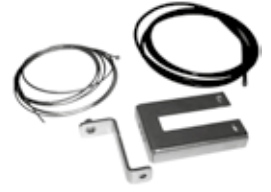
SBLO 01 External unlocking system. Applied on handle lock