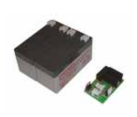
BAT 12K Batteries kit 24 V (2 x 12 V - 1.2 Ah) with connectors and battery charge card