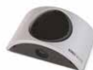
NOVO PH 180