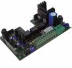
STAR GDO 100 Spare control unit