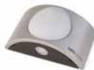
NOVO LT 24 PLUS