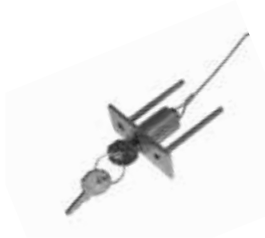
SBLO 500 External unlocking system. Applied with an hole in the door