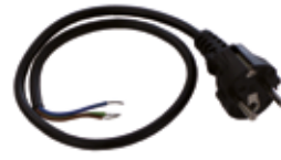
SPI 01 Plug cable. Length 70 cm