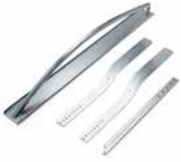
ARC 01 Swinging arm for sectional and overhead doors