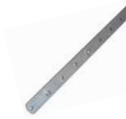
SRO 02 Extension bracket for the pulling arc