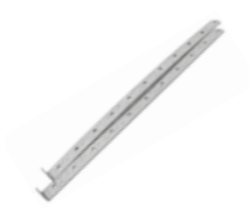
SRO 01 Additional fastening brackets kit