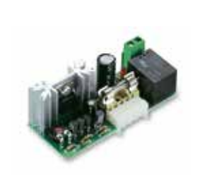
Bat K30 Plug-in card for battery charger