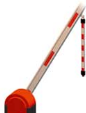
Torque support arm 7615V000