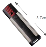
Remote control transmitter STICK 4