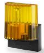
LED flashing LIGHT 230V/24V