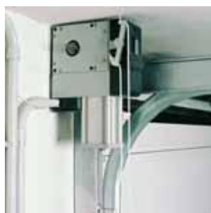
Functional good looks and dimensions that allow installation in the most difficult places