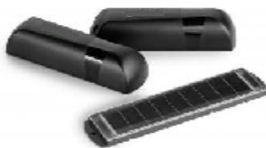
Photocell with sun panel GUARD Solar