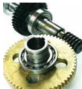
The mechanical components are all made of metal and submerged in oil in order to ensure a long life of the product.