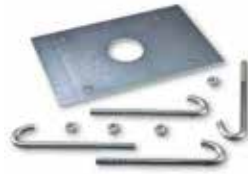
ASOB4000 Anchorage base