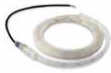
ASOLED4000 Indicator lights for click fixture on upper or lower side of bar. Length 4 m