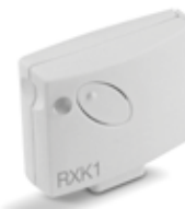
RX K1 Plug-in receiver