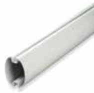
ASO 5000 Bar 5 m