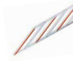
ASOGRID Aluminium rack (2 m)