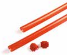
ASORUB Rubber impact protection strip