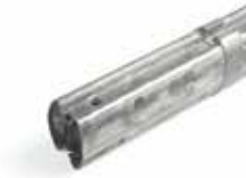
ASOLINK Expansion joint compatible with ASO 3000