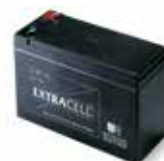
BAT60 12 V, 6 Ah batteries (two batteries required for operation)