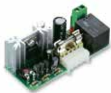
Bat K30 Plug-in card for battery charger